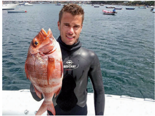
Fig. 2. A specimen of Pagrus auriga captured from Galician waters (NW Spain)

The main morphometric and meristic characters were taken on the preserved specimen of Pomadasys incisus , after defrosting, following Bodilis et al. (2013) (Table 1). These data are in agreement with measurements and counts reported by other authors describing this species (Serena and Silvestri 1996, Kapiris et al. 2008, Bodilis et al. 2013). The specimen showed the main distinctive characters of the species: oblong body, compressed, tapering posteriorly; coloration brownish back, silvery belly, with a dark blotch on the upper corner of the operculum; preopercle with a slightly concave and serrated posterior margin; large head, contained 3.1 times in the standard length; small and slightly oblique mouth; two clearly visible pores on the tip of the chin, and a short, shallow groove behind.