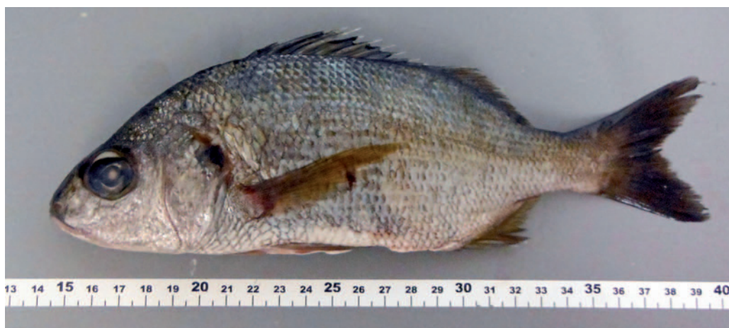
Fig. 3. A specimen of Pomadasys incisus captured from Galician waters (NW Spain)

A sample of muscle from the specimen of Pomadasys incisus was taken for DNA extraction, PCR amplification and sequencing of the standard 5' barcoding region of the mitochondrial COI gene. All procedures were performed as previously described (Bañón et al. 2013) using the primers pair FF2d-FishR2_t1 (Ivanova et al. 2007). A 655 bp nucleotide sequence was deposited in the GenBank repository with accession number KM017063, and was used as query for the identification of the specimen in the Barcoding of Life Data Systems* and GenBank** repositories. In both searches, the sequence was unambiguously matched to P. incisus . To explore the phylogenetic relations a sequence alignment was built using COI sequences from the related species Pomadasys olivaceus (Day, 1875) and Pomadasys perotaei (Cuvier, 1830), which were used as outgroup, and the number of base differences per site was calculated, with a total of 645 positions in the final dataset. The evolutionary history was inferred using the neighbor-joining method (Saitou and Nei 1987) and the confidence limits were tested through a bootstrap procedure (Felsenstein 1985). The evolutionary distances