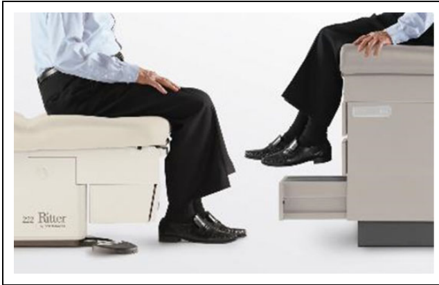
Figure 1. Difference in foot position with relation to floor comparing fixed-height and height-adjustable examination table.