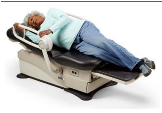
Figure 2. Patient on height-adjustable table that can be raised and lowered for caregiver ease of access during examination or procedure.

Fixed-height examination tables that limit and restrict patient access can in fact have a negative impact on the quality of care a patient receives. In a survey, administrators were asked if parts of an exam were skipped when a barrier to service was encountered when examining a patient with disabilities. Forty-four percent of the administrators acknowledged that parts of an exam were skipped when a barrier was encountered. Practice administrators were asked what alternatives were used if a patient was not able to transfer onto an exam table. Seventy-six percent of practice administrators indicated that patients were examined in their wheelchairs when they cannot transfer onto an exam table: 52.4% of practice administrators reported asking patients to bring someone with them to help with a lift and/or transfer if required. Seventy-seven percent of practice administrators indicated that their employees were trained to lift a patient whereas only 4.8% of practices have a mechanical lift available to transfer patients (1).