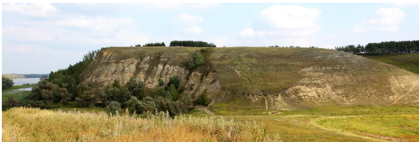
Fig. 26. Omsk Province, Gor'kovsky district, Serebryanoye vill. vicinities