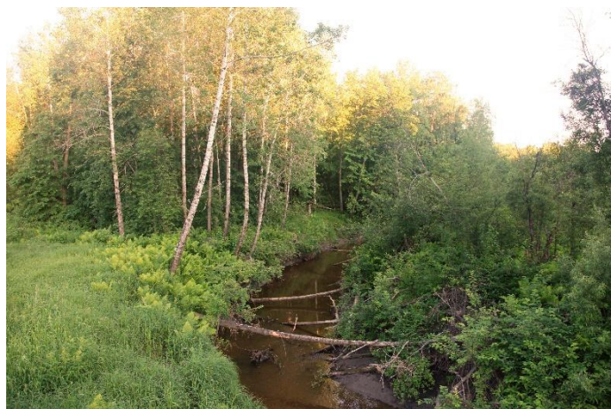
Fig. 25. Omsk Province, Bol'sheukovsk district, Yakovlevka