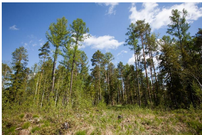
Fig. 24. Omsk Province, Tara district, 4 km N. of Samsonovo vill.