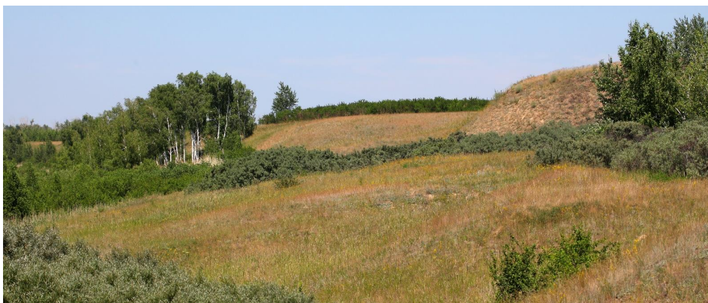
Fig. 27. Omsk Province, Cherlack district, 2 km N of Malyi Atmas vill.