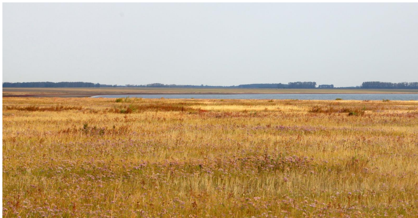
Fig. 28. Omsk Province, Cherlack district, 10 km SE of Perobrazhenka vill., Kurumbel` steppe on the western shore of the lake Sholacksor