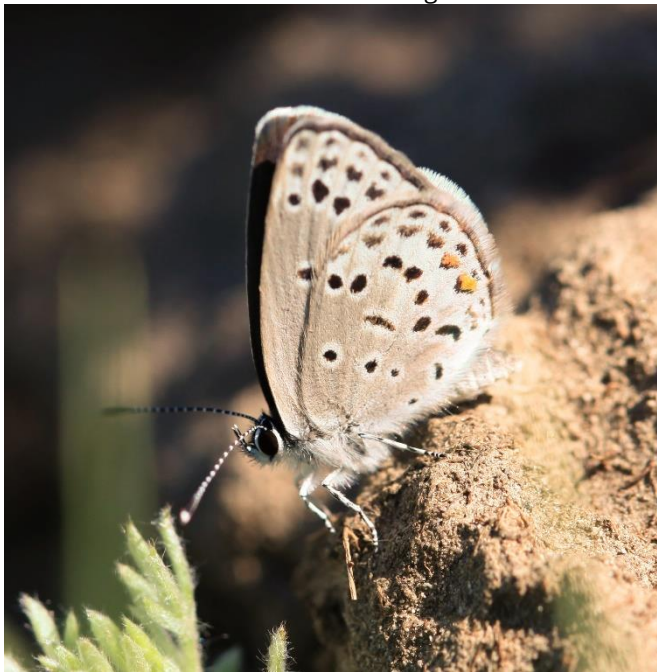
Fig. 22. Tongeia fischeri , adult in nature, Omsk Province, Serebryanoye, 29.V.2017

Remark. New to the Omsk Province. The species is very rare and local on the West Siberian Plain and more common in the mountains of Southern Siberia. The single male collected in forest zone at the northwest of Omsk Province.