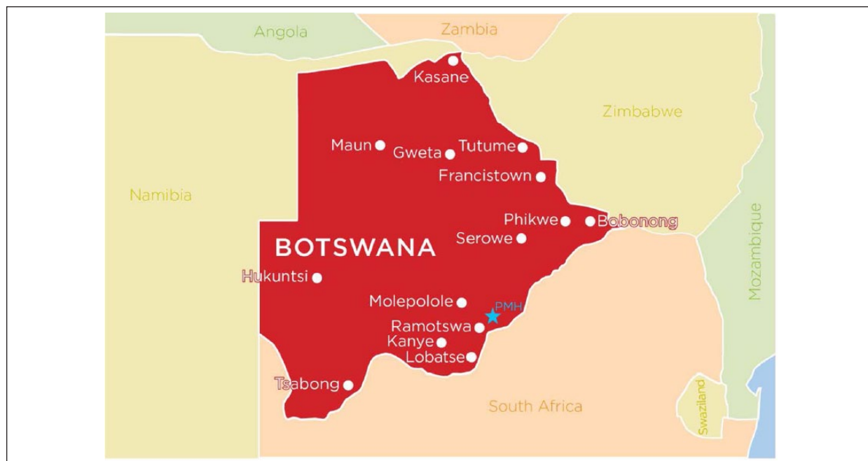
Figure 1. Pediatric cancer recognition training sites in Botswana.

and clinics in rural Botswana have long relied on outreach from PMH and Gaborone for medical education and clinical assistance. 11,12 The goal of the pediatric cancer recognition program was to visit at least 50% of the hospitals throughout Botswana to educate health care workers on warning signs of pediatric cancer and to inform health care workers of pediatric cancer services available at PMH.