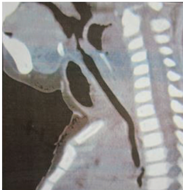
Figure 3. Case 3: CT showing that the cone-shaped bone fragments migrated to the tissue of postcricoid, and air and abscess were found around the neck.

The flexible laryngoscope is a safe, effective, and well-tolerated diagnostic tool for PFBs, it is worldwide accepted and recommended. However, when endoscopy results are