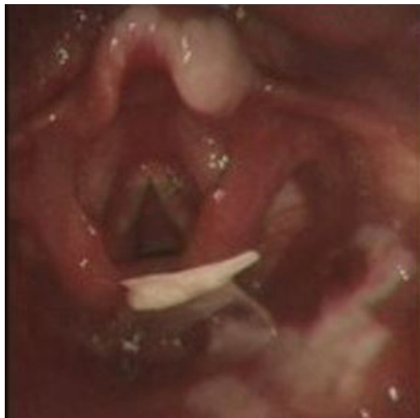
Figure 2. Case 2: electronic laryngoscope showing irregular bone pieces as foreign bodies embedded in the laryngopharyngeal wall and a large piece of erosion near the foreign body.

to location of PFBs and age, while sex, time of PFBs, and nature of PFBs had no significant differences. The dislodgement incidence of FBs in the oropharynx was the highest (56.88%), while that of FBs in the laryngopharynx was the lowest (18.75%). Children less than 3 years old have a dislodgement incidence of up to 66.7% (Table 5).