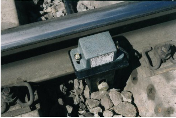
Fig. 3. Magnetic steel fixed next to the railway rail