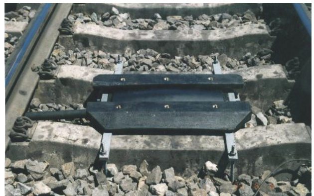
Fig. 2. RF Reader fixed between two railroad ties