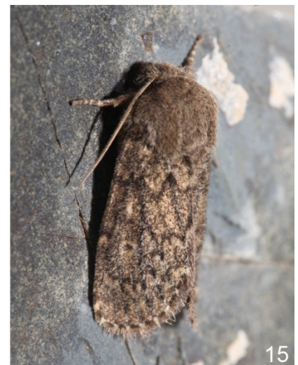
Figures 13–15. Noctuid moths: adults in nature. 13 – Thumatha senex , ♂, Kurkeli natural landmark, 13.VII.2016 (Photo by S.V. Titov); 14 – Phidrimana amurensis , ♂, vic. of Pavlodarskoye vill., 13.VIII.2015 (Photo by S.V. Titov); 15 – Dasypolia timoi , ♀, 8 km SSE of Shiderty vill., 15.IV.2017 (Photo by S.V. Titov).