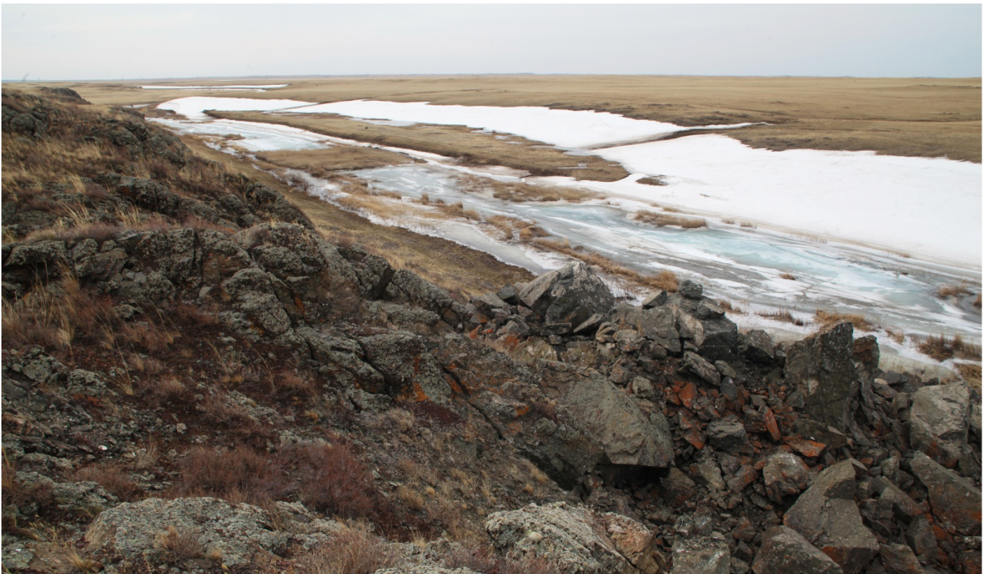
Figure 16. NE Kazakhstan, Pavlodar region, Ekibastuz District, 8 km south-southeast of Shiderty village 51°39'7.13"N, 074°38'53.66"E, 231 m, 15.IV.2017, the habitat of Dasypolia timoi.

Remark. A westernmost known locality of the species. Previously it was known from East Kazakhstan (the type locality: Zaisan) and several localities in the Russian Altai (Hacker, 1996; Volynkin, 2012).