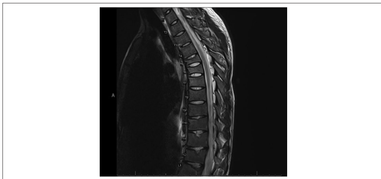
Figure 2. Magnetic resonance image demonstrating chronic T5-L1 compression fractures.

therapy. On further questioning, the patient did endorse mild intermittent back pain over the previous 6 months, which he had attributed to sleeping on a couch. He had no history of trauma. His musculoskeletal physical examination remained normal, aside from the loss in height, with no neurologic signs or focal spinal tenderness. Given the observed loss in height of unclear etiology, imaging studies were performed to better assess his spine. A lumbar spine X-ray demonstrated a superior endplate fracture of L1 and a chest computed tomography scan obtained for primary pulmonary concerns revealed