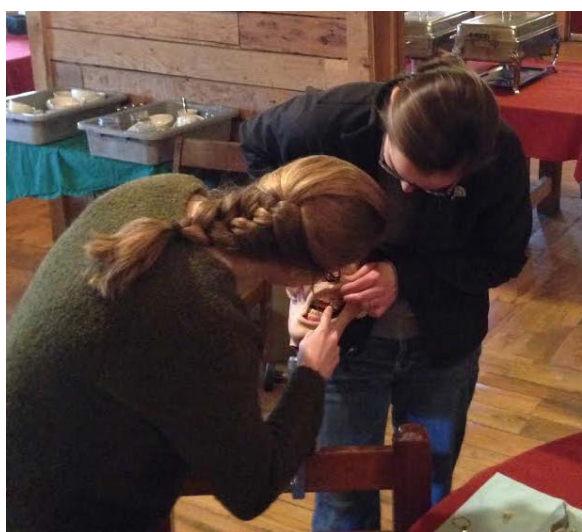
Figure 1. A student and instructor performing procedures at the dental extraction station.

Attendees were given an identical questionnaire prior to the initial lecture and after completion of the workshop