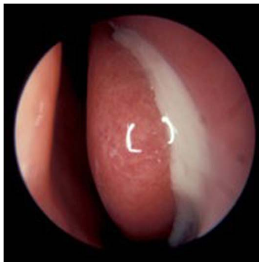
Fig. 1. Endoscopic examination of the left nasal cavity and left middle turbinate demonstrating purulent fluid in the middle meatus.

The clinical presentation of odontogenic sinusitis varies, but most commonly includes symptoms of facial pain or pressure, postnasal drip, nasal congestion,