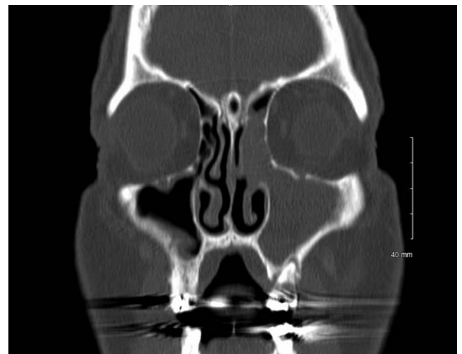
Fig. 3. Computerized tomography (CT) in a coronal plane of a patient with odontogenic sinusitis demonstrating complete opacification of the left maxillary and anterior ethmoid sinuses with associated involvement of the ostiomeatal unit. There is a periapical radiolucency of the left maxillary first molar. Please note, this is the same patient as in Figure 2, taken a week apart.

The bacteriology of odontogenic sinusitis is distinctly different from cases of non-odontogenic sinusitis. 29 Odontogenic sinus infections are generally polymicrobial with predominantly anaerobic organisms present in cultures, commonly including Peptostreptococcus , Prevotella , and Fusobacterium . 3,30 These higher rates of mixed aerobic and anaerobic infections among patients with odontogenic sinusitis have been well documented in the literature. 3,29,30 Zirk et al. 13 reviewed 121 cases of odontogenic sinusitis and noted that 70% demonstrated anaerobes and