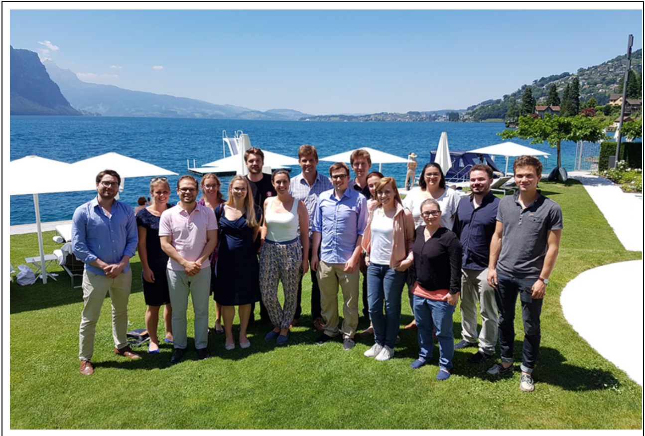
Figure 2. The SAYN Core Group at its last workshop in Vitznau, June 2017. SAYN: Swiss Association of Young Neurologist.

Despite increasing efforts, contact with private neurological practice usually remains somewhat underrepresented during neurological training. The SAYN intends to develop concepts for further improving interaction between neurologists in training and those in private practice, to provide significant two-way flow of information, to better guide development of interested juniors towards private practice and thus to help ensure continuity of neurological care. Recently, the SAYN has been mandated by the SNS to contribute to evaluation and development of a rotation concept for neurology residents into private practice.