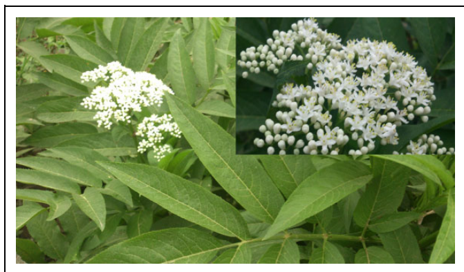
Figure 1. A photograph of Sambucus ebulus from an uncultivated site in Fouman (Gilan province), North of Iran.

violet in color. S. ebulus is native to Southern and Central Europe, Northwest Africa, and Southwest Asia (especially Northern Iran). 11