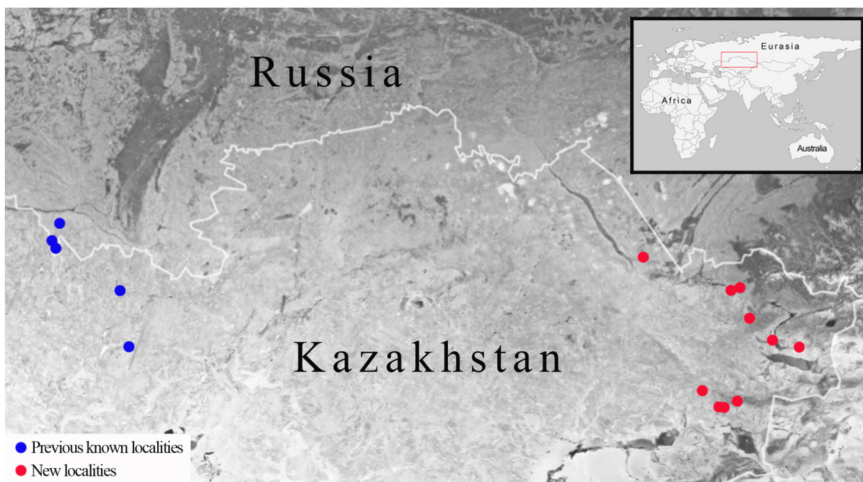
Figure 1. Map of easternmost known localities of E. anatolica .