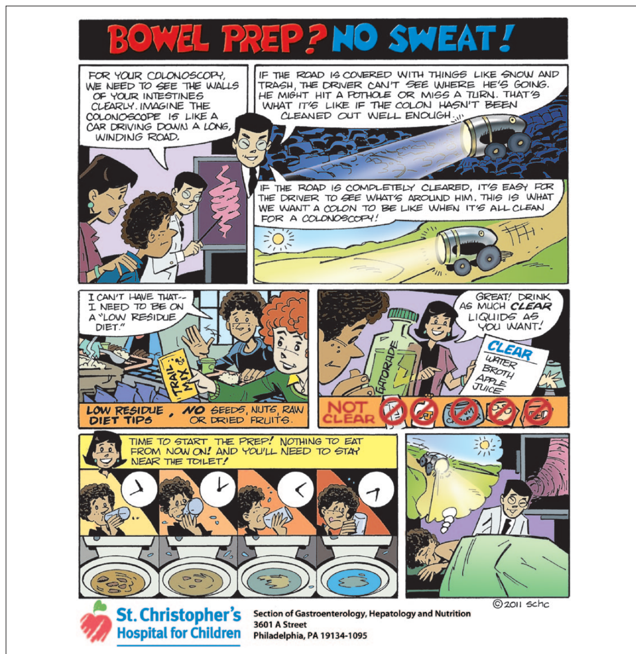
Figure 1. Bowel preparation cartoon. The cartoon underscores the importance of diet and the bowel preparation regimen prior to successful colonoscopy.

staff were blinded to the group assignment. The authors developed the cartoon. It was drawn and created by an independent group of artists who had no role in the study design, collection, or interpretation of data.