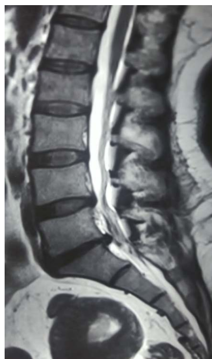
Figure 2A - Repeat MRI lumbosacral spine sagittal section showing regression of previously extruded disc at L5-S1 level