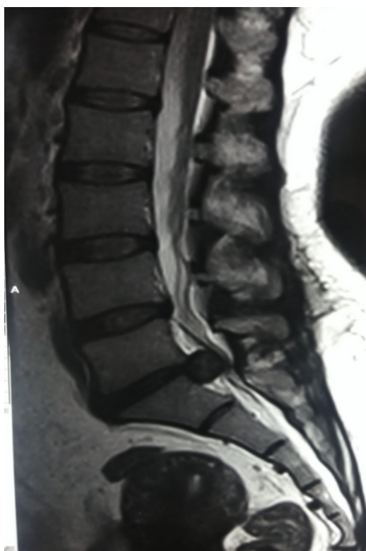
Figure 1A - MRI lumbosacral spine sagittal section showing extruded disc at L5-S1 level

lumbosacral spine revealed a left posterolateral disc extrusion at L5-S1 level (figures 1A and 1B). Patient was advised for surgery but she refused. Conservative treatment including bed rest, physiotherapy, nonsteroidal anti-inflammatory drugs, and analgesics was advised. Patient was on regular follow up on OPD basis. Gradually patient improved within 5-6 months and after 6month repeat MRI of lumbosacral spine was done. It showed regression of previously extruded disc at L5-S1 level (figures 2A and 2B).