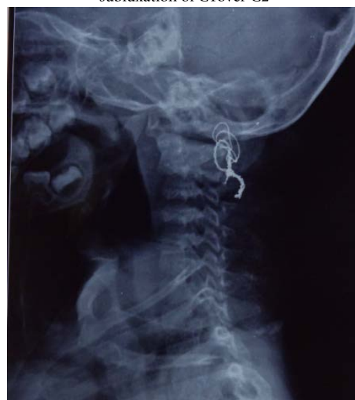
Figure 2B - Postoperative X-Ray

In view of the presence of significant neurological deficits and the posterior displacement of the fractured odontoid fragment, it was felt that conservative treatment with external immobilization might not be helpful. Hence, C1, C2 posterior