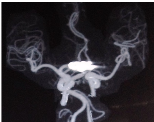
Figure 3 - Post-operative three dimensional CT angiography showing the clips in-situ and with distal flow in bilateral anterior cerebral artery

BAs exhibit rapid changes in size and morphology on angiograms. Other features characteristic of these aneurysms are preponderance of arterial hypertension,