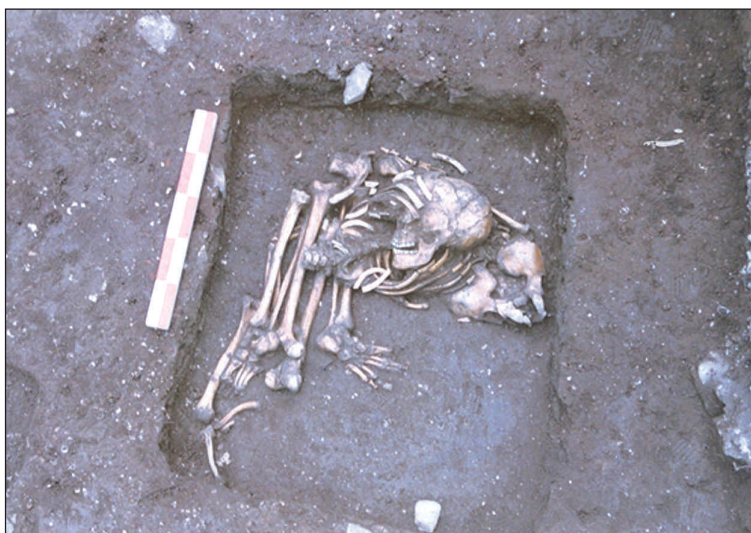
Fig. 4. Disarticulated burial at Dingsishan.

In fact, it is not easy to clearly distinguish sedentary from mobile foragers. To date, archaeologists tend to consider shell midden sites in South China as being occupied by hunters, fishers and gatherers, and sites with little shell remains and traces of sedentism as being occupied by farmers. However, archaeological and ethnographic data from North China, the Yellow River and the Yangzi River Valley and South China have demonstrated that foraging and farming are not mutually exclusive; in fact, the two subsistence strategies often co-existed (Lu 2006b. 149). In Zengpiyan and Dingsishan, where various research methods have been applied to retrieve as much data as possible, although no shells have been found in the last phase of Dingsishan when rice phytolith became very abundant (Zhao et al. 2005), a substantial amount of wild animals has been found (Fu 2004), indicating hunting activities. In Shixia, social segmentation and sedentism are very apparent, but it is not clear whether foraging disappeared, as details of the site are not available. Furthermore, many other archaeological assemblages in South China have not been subjected to comprehensive and multidisciplinary examination, so it is not certain whether the occupants of these sites were foragers with farming as a supplementary economy, or vice versa , or foragers only. At this stage, we can