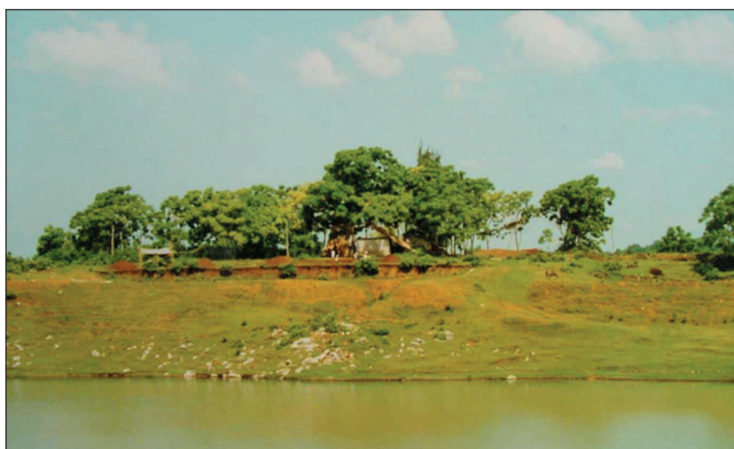
Fig. 2. The Dingsishan site.

Although cobble tools dominate the stone industry in prehistoric South China, small stone flakes produced by direct percussion with a hard hammer have