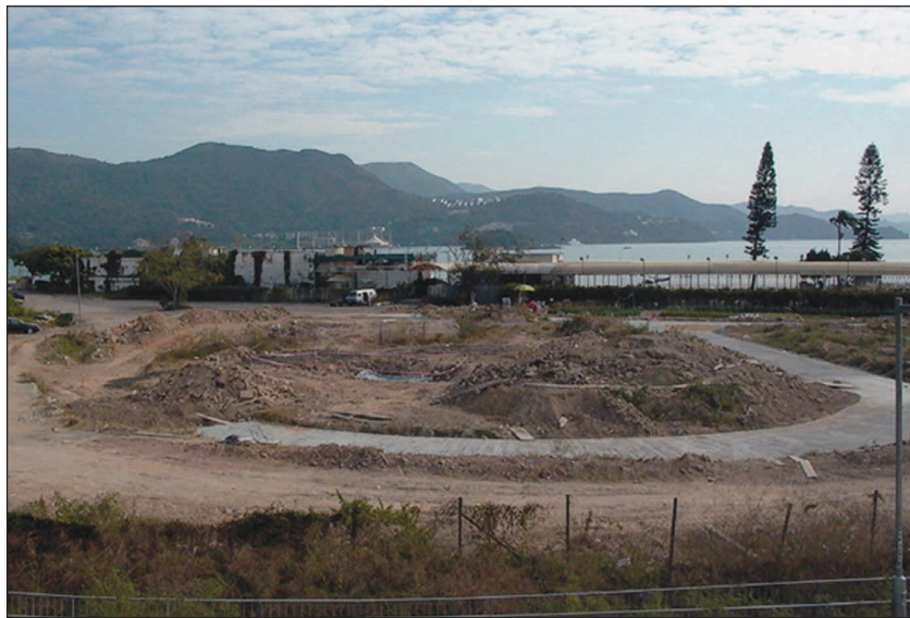
Fig. 3. The Sha Ha site in Hong Kong.

Archaeological experiments and rock studies conducted by the author in Zengpiyan also show that the prehistoric occupants of Zengpiyan had a regular behaviour pattern when making stone tools, or the chaîne opératoire (Grace 1997), from raw material procurement to manufacturing. Today, there are 9 types of mineral and rock cobble in the Li River near Zengpiyan, the majority of which are granite, sandstone and quartzite, with small amounts of slate, limestone, quartz and shale cobble (Lu 2003b). As the local geological structure should not have changed in the last 20 000 years, it can be inferred that the quantity and types of rocks and mineral pebbles available to the prehistoric occupants should have been similar. By comparing the quantity and types of cobbles available in the Li River and the raw materials of the stone implements found in the Zengpiyan cave, it is clear that the prehistoric occupants selected sandstone as the major raw material for making tools, and granite as the major raw material for hammers and hand-stones for tool-making. Petrologically, this selection makes perfect sense. Measured at Mohs 7, granite is harder than sand-