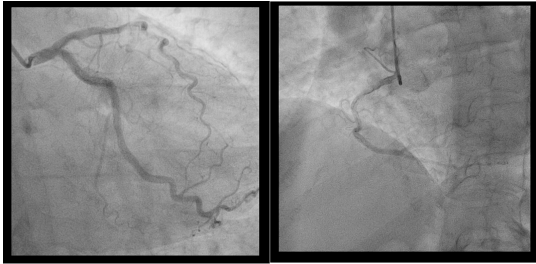
Fig 2. Angiography demonstrated the evidence of normal coronary.

stenosis with evidence of normal coronary arteries. (Fig.2).