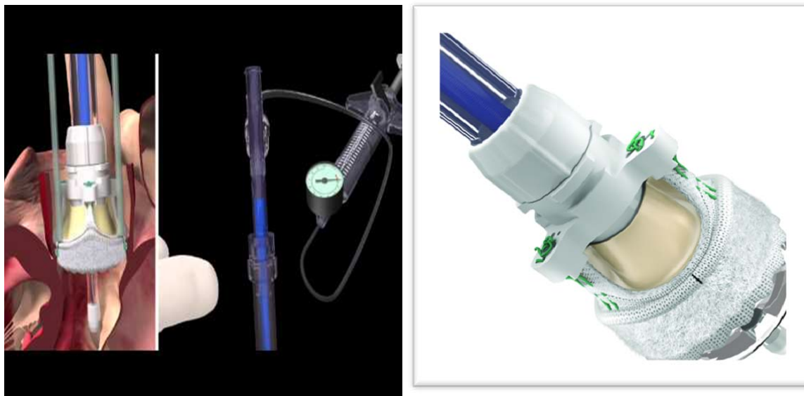
Fig.1. Edwards Intuity Valve System.

We herein describe an innovative approach for AVR, the Edwards Intuity Valve System (Fig.1), in a 67 year-old woman with bicuspid aortic valve and severe aortic valve stenosis, performed through a full median sternotomy.