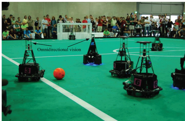
Figure 1. A typical scene of the RoboCup MSL competition.

competition scene is shown in Figure 1. As the competition has become more and more fierce, RoboCup MSL has become an increasingly and highly dynamic environment. Therefore, the visual perception should be run with high accuracy and high robustness in real-time. In this paper, we review the advancement of visual perception in RoboCup MSL soccer robots respectively from the following aspects: the design and calibration of the vision system, the visual object recognition, the estimation of the object's motion, robot self-localization and multi-robot cooperative sensing. The research progresses achieved by our team, NuBot, are also introduced. Furthermore, because many problems in visual perception for MSL soccer robots are common in computer/robot vision research, this survey is also of value for other researchers in the computer/robot vision community. The following sections are organized as follows: the design and calibration of the robot vision system are introduced in Section 2, visual object recognition is introduced in Section 3, the estimation of the object's motion is presented in Section 4, robot self-localization is presented in Section 5, multi-robot cooperative sensing is introduced in Section 6, the developing trends and the research focuses are discussed in Section 7 and Section 8 concludes the paper.