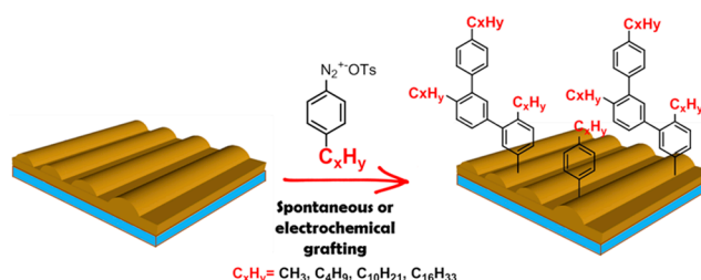
Figure 1. The scheme of the preparation of lipophilic gold gratings.

Prepared gold gratings were chosen as a substrate for plasmonic sensor fabrication due to homogeneous response and strong signal enhancement, as was described before [5]. The surface of the gold was modified by a range of arenediazonium tosylates (ADTs): ADT-CH 3 , ADT-C 4 H 9 , ADT-C 10 H 21 and ADT-C 16 H 33 in order to improve affinity with lipophilic biological compounds (Figure 1). Two modification approaches were tested: spontaneous and electrochemically induced grafting.