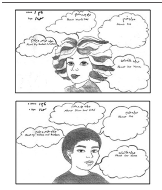
Figure 2. Picture-Aided Questionnaires.