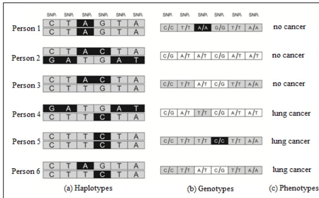
Figure 3. Description of haplotypes, genotypes, and phenotypes

SNPs found on chromosome set is called a haplotype. High-given methods, each allele are not capable of distinguishing the source chromosome. Position of the two alleles of a SNP is usually only take care of such methods. This is the source of alleles chromosomes identifiable. This combined with the target locus allele genotype is called knowledge. In a healthy state of being of an individual or the individual's phenotype of the patient is called. Figure 3 describes all haplotype, genotype, and phenotype [81].