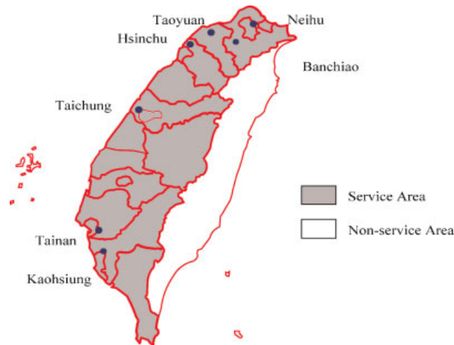
Figure 1. Service coverage of T-company in Taiwan.

receiving the order. This commitment is what T-company promises to the customers in most of the service areas in Taiwan.