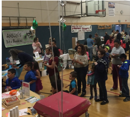
Kids lining up to get their free book.

to the instructors, and they were excited to partner with me. I now carry with me a crate of books, laptop and scanner. I have the ability to register new patrons and provide library services once a week.