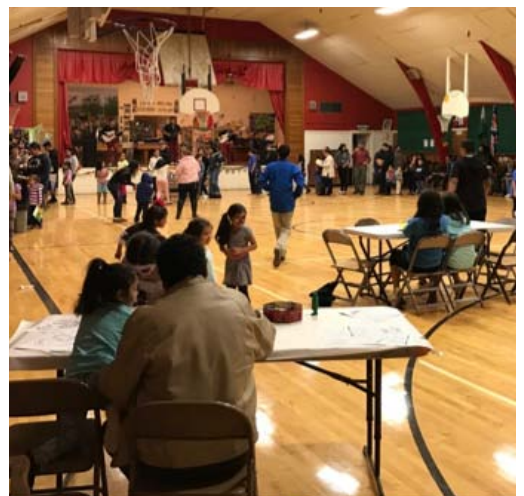
Día de los Muertos celebration.

One of my creative and continuing efforts to provide outreach to the Odell community has been to offer library services at a Zumba class. I have been visiting the class for over two years. This opportunity came to be because of my little sister. She took me to a free community Zumba class offered in Odell. As I quickly discovered, this was a perfect opportunity to promote library services. I attended the next Zumba class where I presented my ideas to promote the library