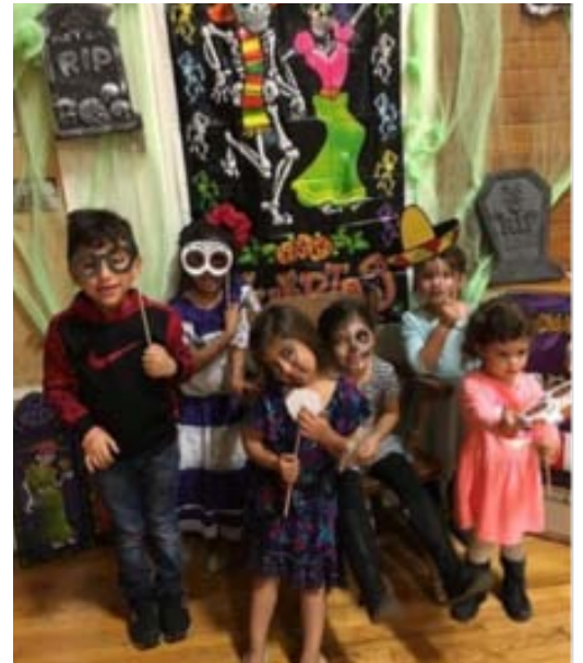
Group of kids at the photo booth.

Día de los Muertos is celebrated on November 1 and 2. It is a day to remember passed loved ones. I have been able to bring such a big event to this small town because of great community partners and community volunteers. This past November local sponsors helped provide a full dinner including dessert and coffee, live music, and crafts for kids. The feedback from the community was positive, and over 300 people attended.