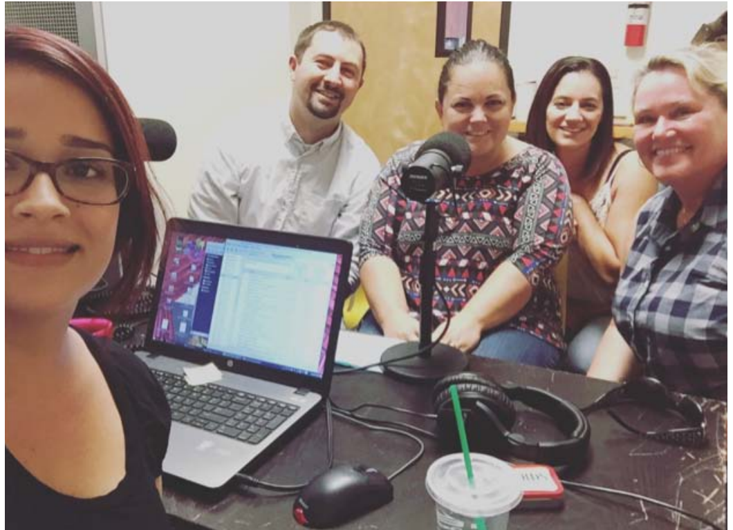
Taking a little time off air to take a picture with the Directors of the Migrant Summer School.

Finally, I would like to mention a program that the library has been involved in for a year now. With Ready to Read funds, the support of Wy'east Middle School in Odell and our Children's Services staff, the library has set forward another great project. We now provide bus transportation from Odell to Hood River and back; we call this the Odell Express Bus. With the support of the school, they send out an auto-call the night before the bus to families. When children and families arrive at the library, they get the opportunity to watch a movie, have a snack, and participate in story time. Each child leaves with a free book. The service is intended to provide transportation services to families that don't have the resources to make it to town.