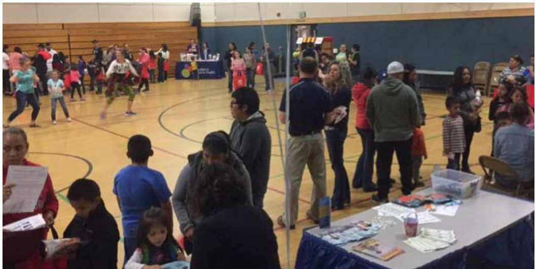
St. Francis Zumba class teaching kids some Zumba moves.

Recently, I have also been representing the library as a DJ on our local radio station, Radio Tierra on 95.1 FM. With the encouragement of the radio director, I now have two shows. One is called La Hora Infantil , which focuses on children. For an hour I play Rondas Infantiles (Spanish children's songs), provide a story, and talk about the things the library is doing. I recently started a new thirty-minute segment called Recursos Informativos . During this time I have a special guest who talks about the services they provide to the Spanish speaking community. I have had over 15 organizations participate and have made connections with great people. I also give other libraries within broadcast range the opportunity to come on my show to talk about the services and programs they offer. It is a great way to stay connected and show the surrounding areas that our focus is all the same. Since I started appearing on the radio, the attendance at my programs has increased. Many people call in during my show to voice their thoughts and opinions, and so far, everything has been positive.