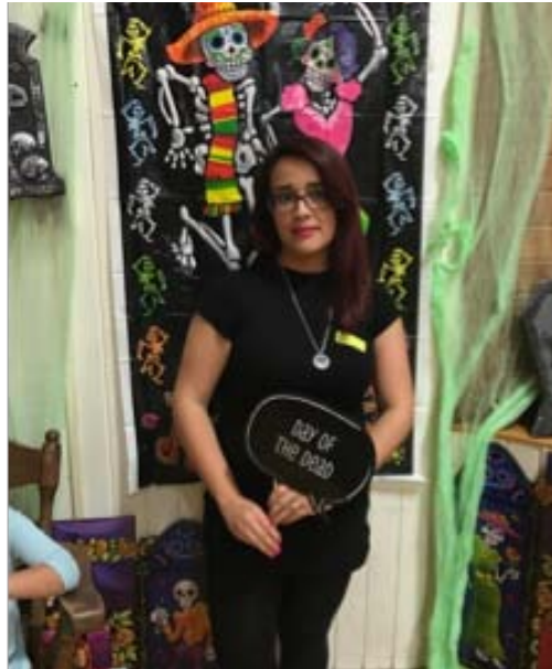
Taking a picture at the photo booth (Me).