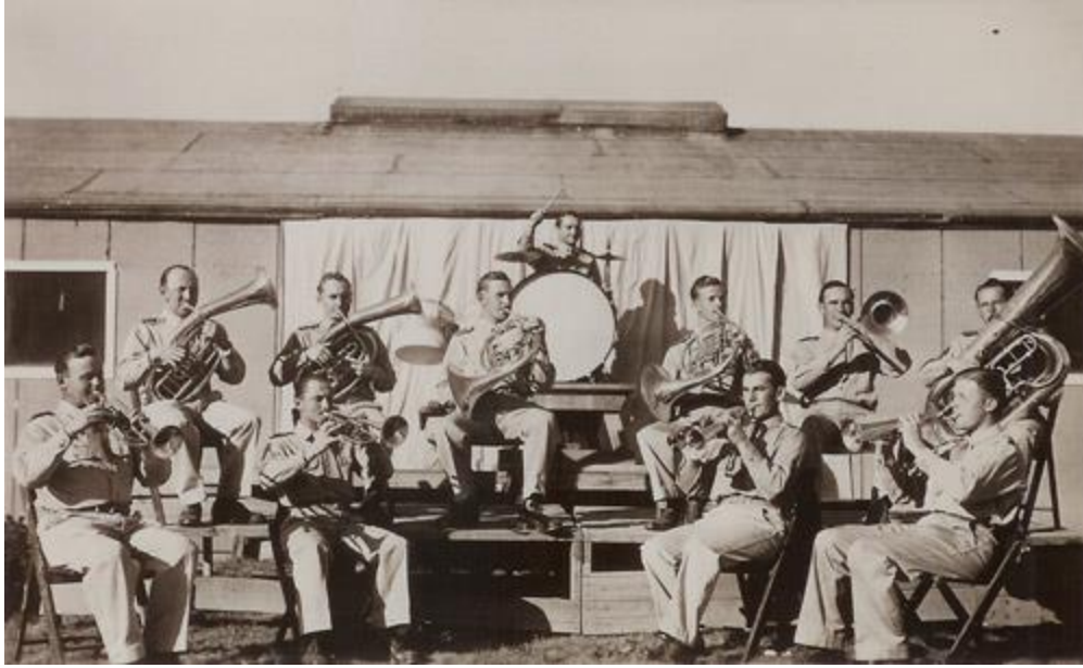
German POWs from the 47 th Grenadier Band, one many such leisure activities establish by and for the POWs at Concordia.

Once the program began to gain traction, the purchase of teaching materials, textbooks, charts, films, etc. were made on behalf of the German Red Cross, the International Red Cross, and the War Prisoners' Aid of the Y.M.C.A. These materials combined to form a scientific library containing more than 7,000 books covering practically all fields of knowledge. 59