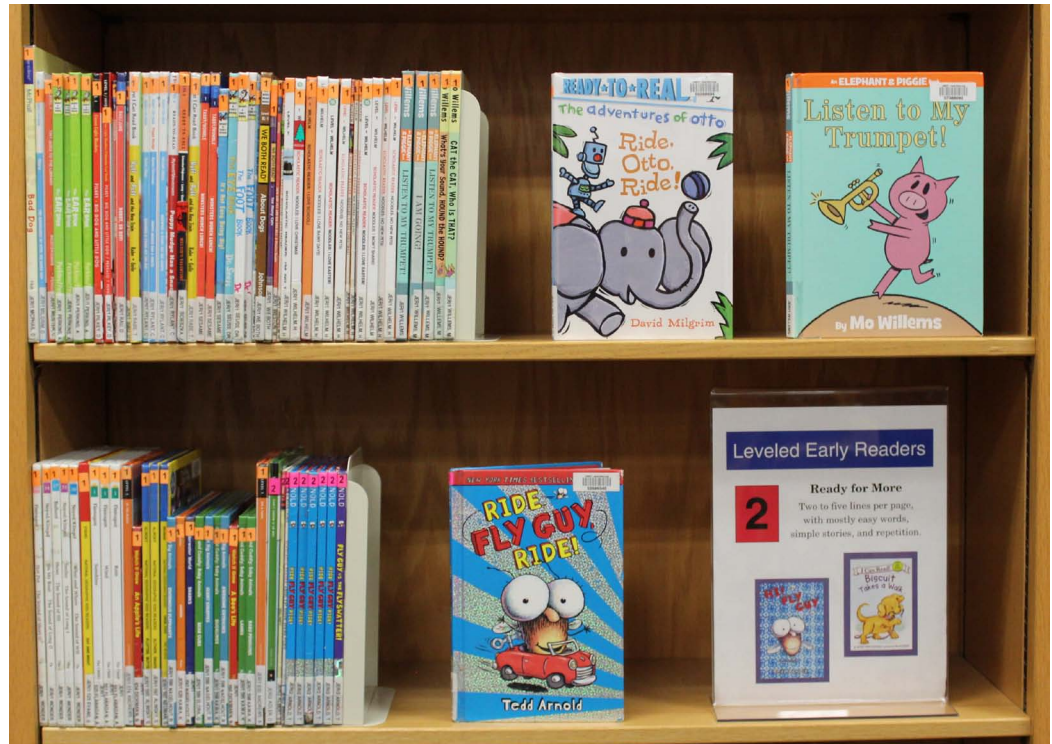
Leveled Early Readers

much about it. The “don’t worry” part goes against all of our cataloging training, but in this case, we just had to let that go. So what if we assign a “3” to a book that probably should be a “4?” That’s fine. We want a few more challenging books among all the other “3s”; we also probably want a few high “2s” in there for readers who have just moved up to that level.