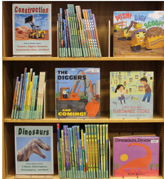
Picture Book Topics

We also learned that the Picture Book Topics section could support our efforts to share early literacy information with adults. When we talk about the value of singing to kids or vocabulary-building that happens when children tell stories, we also guide them to our topical sections featuring “Songs and Rhymes” and “Wordless Books.” Sections on “First Experiences” and “Behavior” address some of the challenging phases of childhood (and parenthood). Soon we will also add simple non-fiction titles to selected topics.