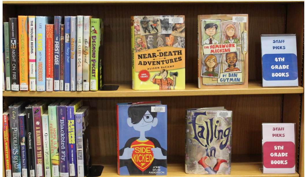
Fiction Staff Picks by Grade Level

paper on the perils of labeling books with reading levels. On the other hand, we knew from observation that the user experience for kids is impacted, at least partially, by their age.