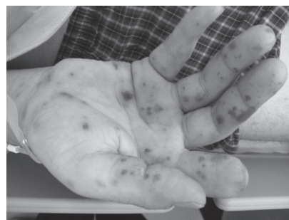
Fig. 1. Right hand of patient showing dusky-purple papules on the palm.

On admission, he had a blood pressure of 117/76 mmHg, pulse rate of 96 beats/min, temperature of 39°C, and respiratory rate of 31 beats/min. On physical examination, heat, tenderness, and swelling were observed in his left wrist, left elbow, and left knee joints. Other physical symptoms observed were the appearance of purpura on the lower legs, red papules and pustules on the forearms, and dusky-purple papules on the palms (Fig.1). The examination of his skin and extremities revealed the abnormalities as described above; otherwise, his exam was clear. At the time of his presentation to the ER, the associated bite wound was already healed. Clinical laboratory test results demonstrated signs of inflammation. The white blood cell count was 11,800/ \mu L with 78% neutrophils and C-reactive protein was 16.1 mg/dL. According to the history of present illness and physical