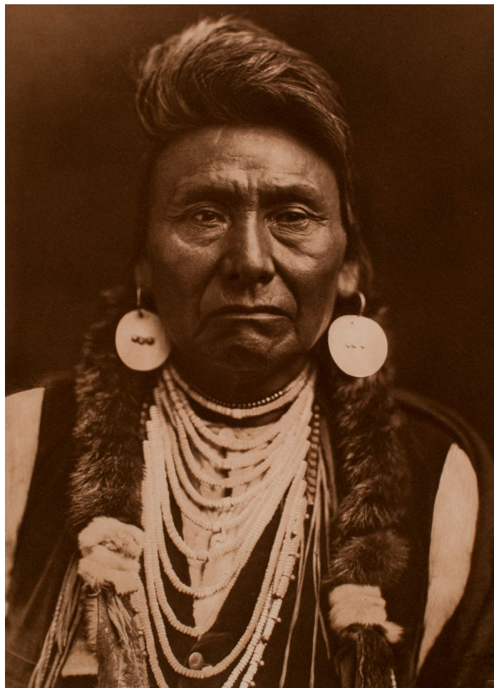
Chief Joseph, by Edward S. Curtis.