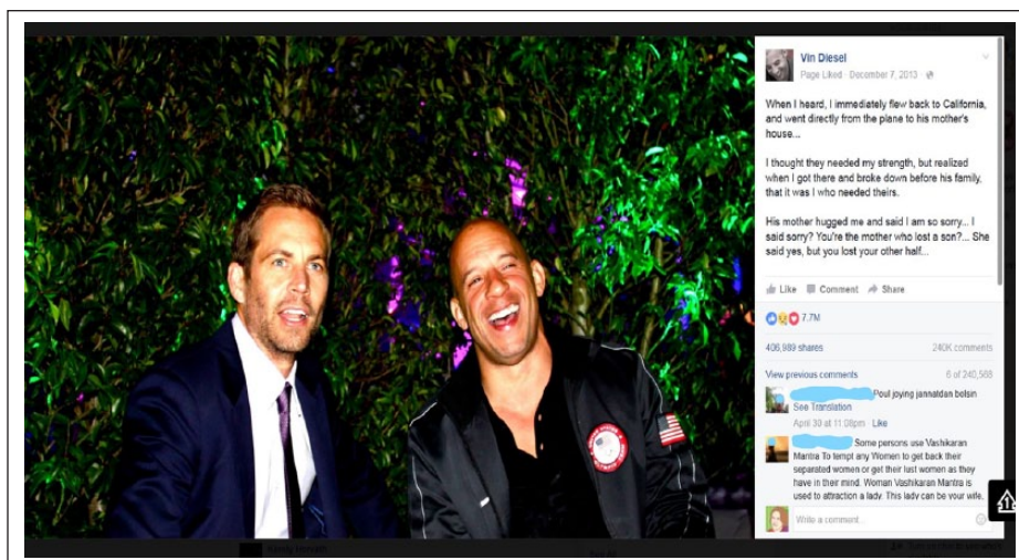
Image 1. Post A – posted shortly after the death of Walker. Screenshot from Vin Diesel’s public Facebook profile. Posted December 7 th , 2013.