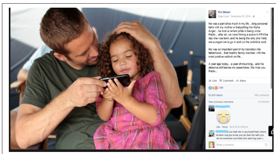
Image 2. Post B – posted a year after the death of Walker. Posted November 30 th , 2014.

is also apparent in some of the quotes, I present below, which I have chosen to present exactly as they have been written, in order to convey how people also sometime struggle with expressing their emotions properly in a language which is not their own. While it is impossible to check for the nationality of all commenters in such a big sample, the use of language or explicit references to the commenter’s nationality (“Brasil loves you!”) gives a good indication of the global popularity of VD. Thus, the 1800 comments included comments from people in Russia, India, The Philippines, Thailand, Vietnam, China, Rwanda, Brazil, Italy, Spain, Turkey, England, the US, France, Germany, Nicaragua and Hungary.