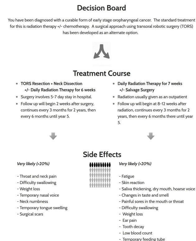
FIGURE 1 Sample visual from the decision aid for patients diagnosed with early oropharyngeal squamous cell carcinoma.

Most of the healthy volunteers (82%) selected TORS as their preferred treatment option—a result that was consistent regardless of the interviewer’s background (surgery or radiation oncology, Table 1). All participants switched to the alternative treatment at one of the trade-off points offered, confirming the expected psychometric properties of the DA. Analysis of the trade-off switches revealed that participants required an average of a 15% increased cure rate (range: 5%–50%) with the alternative therapy to abandon their initial treatment choice, which was true regardless of the treatment initially selected (Figure 2).