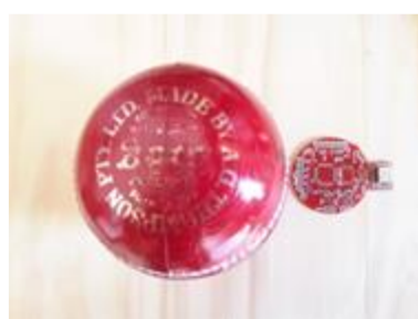
Figure 1. (Left) Smart cricket ball and its printed circuit board and sensor compound; (right) exploded view of the smart cricket ball design.

The smart cricket ball used in this study [5–7] samples the angular velocity data about the three axes of the ball's coordinate system at 815 Hz with three high-speed digital gyroscopes, measuring up to 50 rps each. The data are transferred wirelessly to Smartphone or computer via Class 2 Bluetooth radio. RF transmission range reaches up to 20 m in a line of sight condition. The ball is able to collect up to 28 min of bowling data on the onboard memory which allows approximately 80 bowling deliveries (bowling duration of 20 s). The downloaded data were analysed using the Smart Cricket ball software, developed in Python programming language. The leather skin of a commercially available cricket ball was used in the assembly to achieve the realistic feel and aerodynamics of a real ball. A CNC-machined nylon6 nutshell was inserted in the ball to protect the electronic components from impact force and to balance the mass of the instrumented ball (160 g). A highly miniaturised electronics system (including printed circuitry board, sensors, and battery) has half the size of the ball and weighs less than 20 g. The electronics includes three single axis high-speed gyroscopes, a tactile actuator, and a battery (Figure 1).