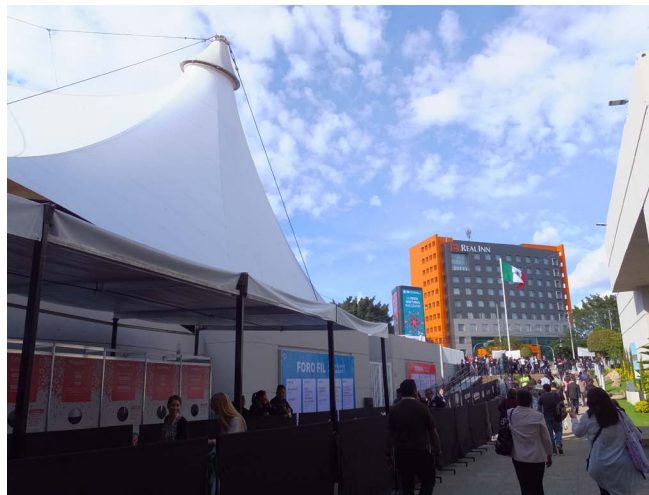
Entrance to the Expo Center.