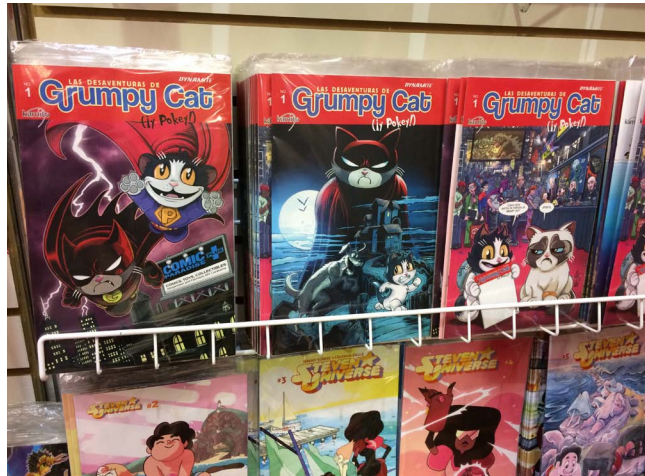
Grumpy Cat graphic novels.