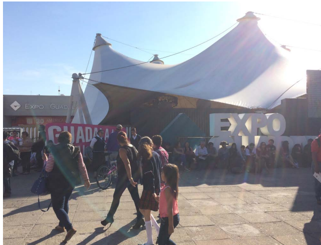
Entrance to the Expo Center.