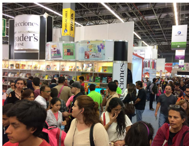
A busy weekend day (open to the public) at the FIL.

The project we put together is called “Libros for Oregon: Collections Connect Communities.” Its primary goal is to increase access to high-quality Spanish language books for the users of Oregon libraries, particularly users of smaller, rural libraries. Having received the grant, we have now embarked on our planning year (2016–17), to be followed by an implementation year (2017–18), and, I hope, an annual program that continues indefinitely.