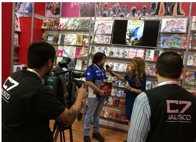
A state TV station interviews a knowledgeable comics vendor.

can we find a wide selection of diverse books appropriate for our Spanish-reading patrons? Guadalajara, Mexico!