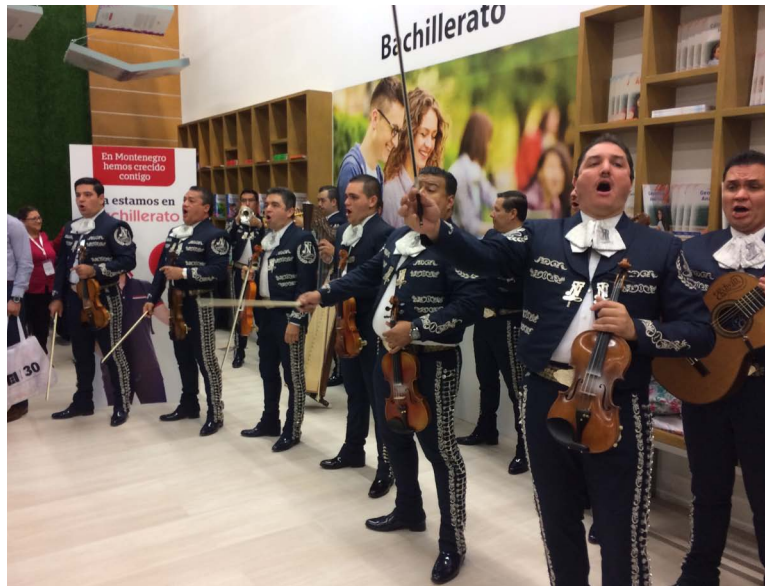
Mariachis perform at a publisher happy hour.

Mexican national presses, novelty book-sellers, publishers of youth materials, manga and comics, a whole transplanted used bookstore, and an entire wing for the headquarters of international publishers. There is color and activity everywhere, and the celebratory strains of mariachi music can regularly be heard, dazzling a private publisher party or leading a parade