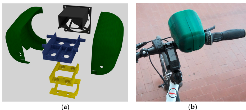
Figure 1. Monitoring system: (a) assembly scheme rendering; (b) as installed.

The airflow hits the front part of the device: one part passes through a thin slot placed on the top and flows around the surface of the temperature and relative humidity integrated sensor which is shaded in order to avoid the effects due to sun rays. The other part of the airflow is used by the power charging system realized considering a solution developed by a young maker [6] consisting in an old PC fan that recharges the battery which powers the device. The system described above sends data through the Bluetooth module to an app for mobile devices.