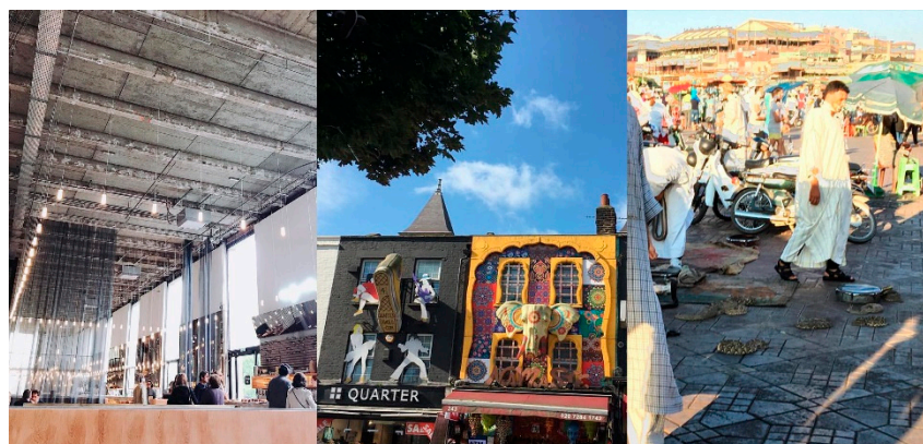
Figure 4. Three images from different Instagram accounts, selected with a geo-based research, that show the reference places declared by FKP.

It is clearly an image that allows you to approach a discrete form through a pre-configuration based on the condition of collaboration. A “wide” scenario calls for participation in the sharing of personal resources, for the implementation of an image whose original direct references are the Paris Palais de Paris (built in 1937, expanded in 2002 by Lacaton and Vassal), Camden Town, Place Jemaa el Fna in Marrakech [10] (Figure 4).