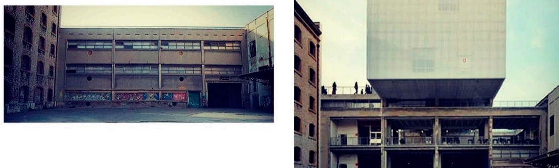
Figure 2. Two images from La friche instagram account. The pictures represent the same place before and after the architectural intervention by Patrick Bouchain and Mathieu Poitevin.

Contrary to what has happened in many other similar cases, the transformation of Friche did not lead to a substantial increase in the values of the surrounding properties, nor to a transformation of the social composition of the neighborhood population. Several researches raise the fact that from the very beginning Friche intervention has been configured as an autonomous action in its own context, essentially disconnected from the Marseillaise cultural networks, turning to international systems of cultural production [2].