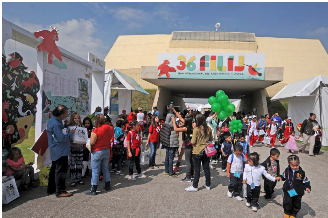
A view of the entrance to the Feria Internacional del Libro Infantil y Juvenil (FILIJ) as school groups arrive at the fair. FILIJ outgrew its location and was relocated in 2016 to the Parque Bicentenario, receiving visits from over 42,000 students from 450 schools.

In 2015, U.S. librarians attending FIL increased by 45 percent from 2014. In preparing for attending the FIL a second time, I reviewed circulation statistics for MCL's Spanish language collection and received feedback from colleagues about the needs at each location. Based on this information, and from learning the previous year how crucial it is to be strategic and stay focused during the limited time at FIL, our selection focused on juvenile materials and