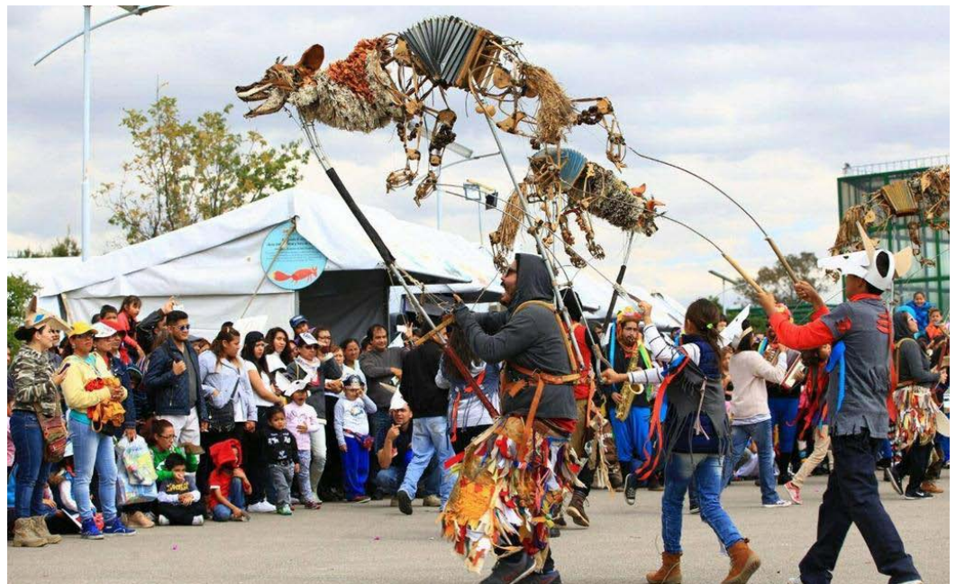
Las bestias danzan (The beasts dance) performed by a local theater group, La Liga — Teatro Elástico, during FILIJ 2016.

As the Spanish-language publishing market expands, FIL attendance continues to grow, and so do its program offerings. Leyhla Ahuile of Publisher Weekly reported that FIL 2016 hosted 2,000 publishers with books in 23 different languages, including indigenous languages such as Tzotzil, Zapoteco, Nahuatl and Maya. During FIL 2015 I had the opportunity to attend a book launch of Sendak's Where the Wild Things Are translated into Maya. Due to the increasing geographic diversity of authors and publishers that participate in FIL, the fair has been called the "New Frankfurt" by Tomás Granados Salinas, The Bookseller , and others. Frankfurt is the largest and most important book fair in the world.