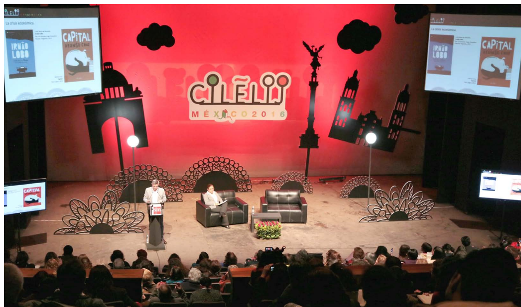
The third edition of Congreso Iberoamericano de Lengua y Literatura Infantil y Juvenil (CILELIJ), held in Mexico City in November 2016, brought together over 70 speakers from 16 countries to talk about literature for children and young adults.