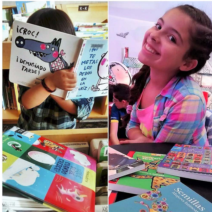
Treasures found at the Feria Internacional del Libro (FIL) that will surely be popular among library readers.