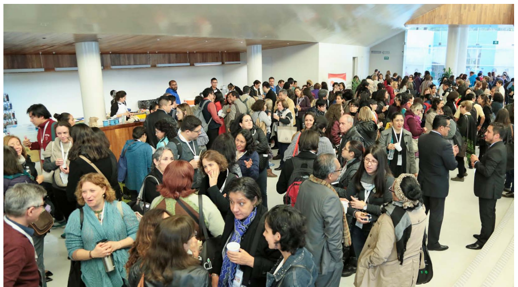
CILELIJ provided educators, authors, scholars, and librarians the opportunity to connect with each other to learn from each others' efforts to promote literature for children and young adults.

Staff working in Mexico's National Institute of Indigenous Languages, Dirección General de Lenguas Indígenas , shared information about their latest publications, including materials for all ages in all of the indigenous languages that are documented in Mexico. Also in attendance were librarians and promotores de lectura who have worked in their communities for many years coordinating activities to promote literacy in popular non-traditional reading spaces. For example, Amoxpoani Promotores de Lectura leads story and craft hours at local markets every Sunday. They continuously explore using new materials and methods for storytelling, including performance, puppets and kamishibai theater. Those conversations inspired great ideas for culturally rich and entertaining literary activities that I would like to try in my work as a bilingual youth librarian.