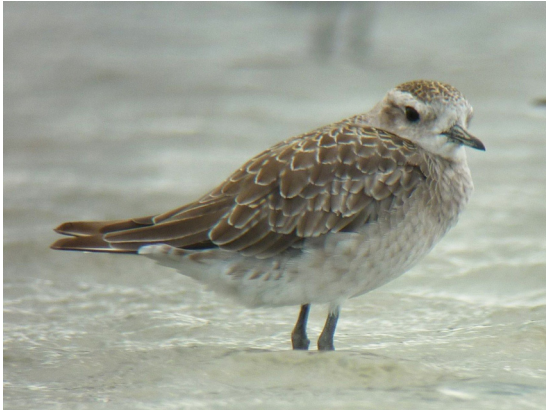
Fig. 2. American golden plover at Little Waihi, Bay of Plenty, 12 January 2011.