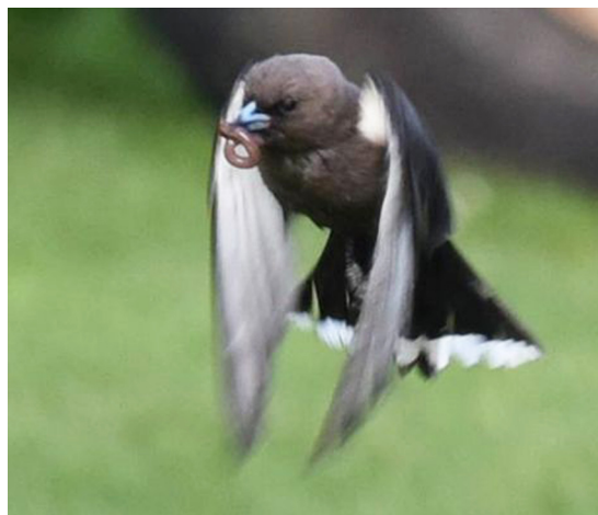
Fig. 3. Dusky woodswallow near Oban, Stewart Island, 27 September 2014.

One at Oban, Stewart Island, on 27 September 2014 (Satoshi Kakishima & Tomoe Morimoto; UBR