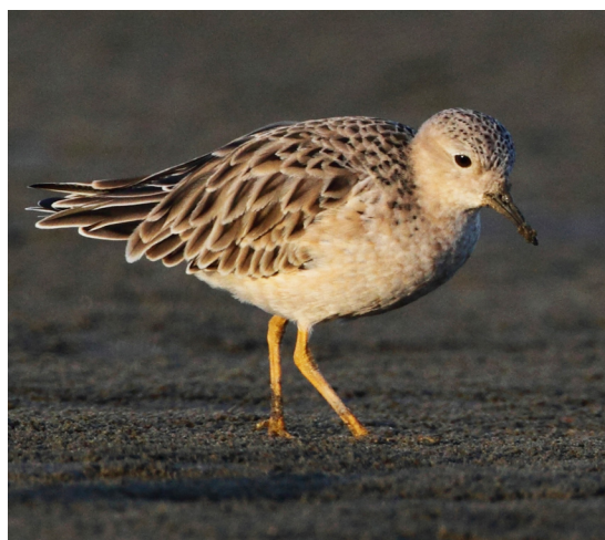
Fig. 1. Buff-breasted sandpiper at South Kaipara Head, 1 April 2014.

One at the tip of Kaitorete Spit, Lake Ellesmere, on 23 October 2012; Philip Crutchley & Andrew Crossland (UBR 2013/09); 1 at Crescent Island, Lake Ellesmere, on 7 December 2013, with 2 there on 9 & 15 January 2014; Philip Crutchley & Andrew Crossland (UBR 2014/51); 1 at Ashley-Saltwater Creek estuary, North Canterbury, on 28 December 2013; Andrew Crossland (UBR 2013/85). One or