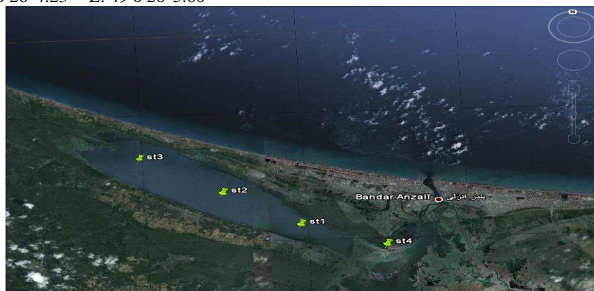
Figure 1: Sampling site in Abkenar (Western part of Anzali wetland)

Station 4: N: 37 o 26' 4.23" E: 49 o 26' 5.60"