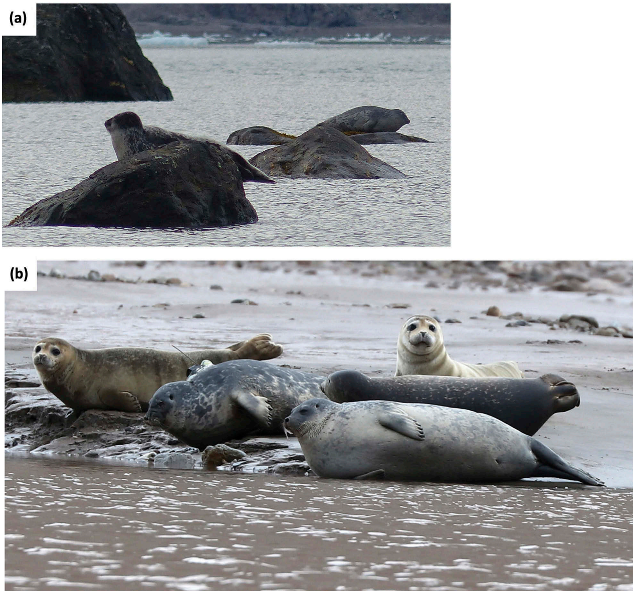
Figure 2. (a) Ringed seals hauled-out on rocks in Adolfbukta, Svalbard; note glacier ice in the background. (b) Three ringed seals (in the foreground – one with a Satellite Relay Data Logger) and two harbour seals in the background hauled out together on shore in St Jonsfjorden, Svalbard; the yellowish fur of the two harbour seals shows that they are still moulting.

pieces routinely. However, these glacier ice pieces never enter the lagoon because of its shallow entrance. It is assumed that the ringed seals come into the lagoon in search of ice platforms (sea ice in lagoons freezes up earlier and stays longer than fjord areas due to fresher water and less wave action) or perhaps food (Arctic char [ Salvelinus alpinus ]). However, in 2016 all five ringed seals tagged inside the lagoon hauled out on shore within the lagoon, while also using glacier ice deep in the fjord to some degree (Fig. 3). It is worth noting that in 2012, all of the tagged seals returned to the lagoon to haul out late in the season, following the formation of sea ice, which they used as a haul-out platform.