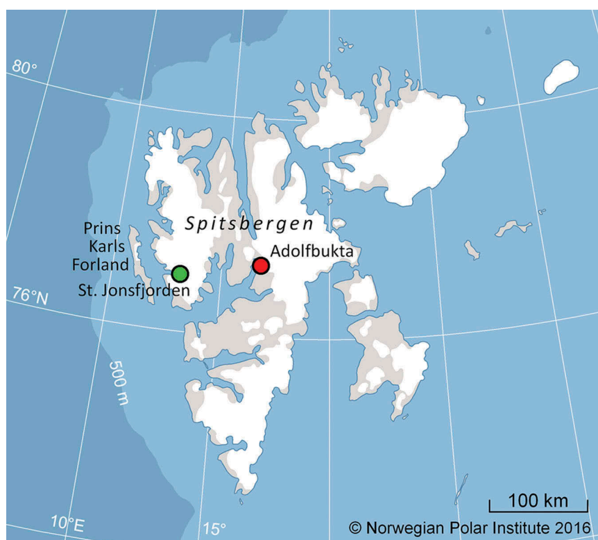
Figure 1. Map of Svalbard where place names mentioned in the text are indicated. The red dot is where the ringed seals in Fig. 2 (a) were hauled out and the green dot is where the mixed group of ringed and harbour seals in Fig. 2b were hauled out.