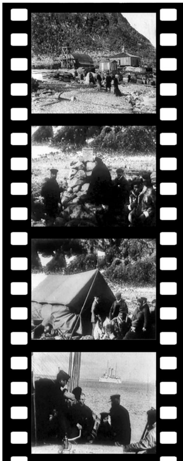
Figure 3 More stills from the film. From top to bottom: the base camp at Virgohamna built by the Wellman expedition in the summer of 1906, with the machine shop and hydrogen generator to the left and the Chicago Record-Herald House (also called the Wellman House), with the American flag, to the right; Wellman examines the cairn monument built on the site at Virgohamna where the Swedish balloonist Salomon A. Andrée lifted off in July 1897; the tent at Virgohamna where Wellman found German newspaper correspondent (and nominal spy: see Capelotti et al. 2007 [this issue]), Otto von Gottberg; Wellman tips his cap to the camera as a small steam launch takes him to a waiting passenger liner anchored offshore—as described in the excerpt from Tromsøposten , this may have been in order to meet the passengers over dinner.

Lantern Weekly advertises the film as being 500 ft in length. The 1906 film is eight minutes long and lacks intertitles, which was not unusual in films of this era (Thompson & Bordwell 2003). The scenes do not appear to have been edited entirely chronologically: there are sudden jumps from mainland Norway to Spitsbergen and back again to the continent.