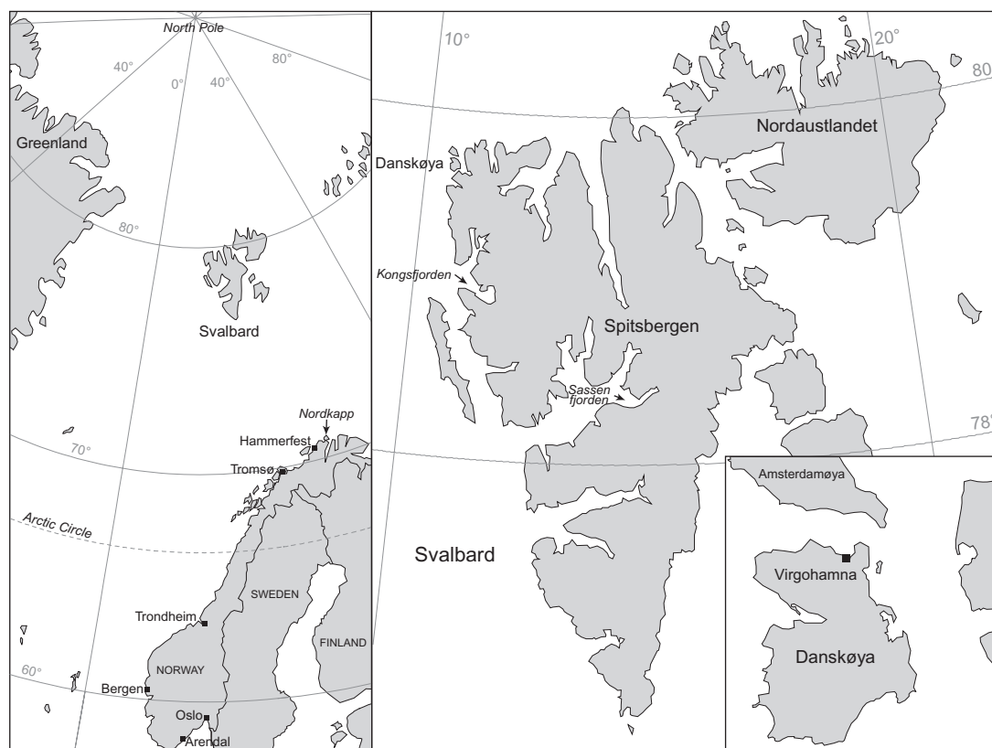
Figure 1 Sketchmaps of Scandinavia, Svalbard and Danskøya.

Wellman?" The newspaper had found it warranted to print a more rounded presentation of the man: