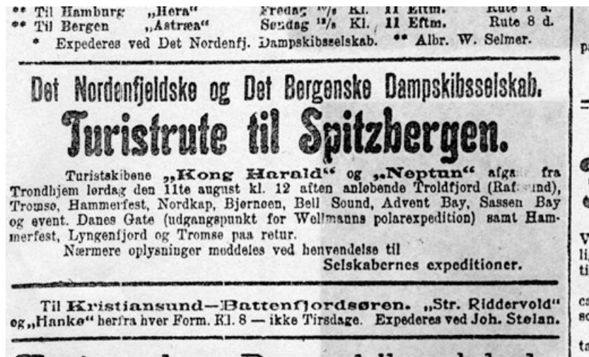
Figure 4 An advertisement for a tourist cruise in the newspaper Trondhjems Adresseavis , 10 August 1906. Note the mention of “Danes Gate (starting point for Wellman's polar expedition)”.

Wellman onshore (Fig. 2), a long pan showing the Wellman house with its American flag (Fig. 3), the camp of the German journalist, Otto von Gottberg, the memorial stone for Andrée's balloon expedition, and scaffolding for the balloon hangar. The film cuts to close-ups of the members of the expedition, Wellman taking notes at Andrée's memorial (Fig. 3) and Gottberg conversing with tourists (Fig. 3), before the film ends with close-ups of Wellman as he is rowed out to one of the tourist ships (Fig. 3) while he smiles and doffs his cap to the cinematographer.