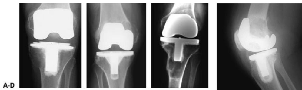
Figure 3: [A–C] Osteolysis. Osteolytic lesions are identified in [A], medial tibial plateau, [B] medial femoral condyle, and [C] proximal tibia] D] Osteolysis, distal femur. There is a large osteolytic lesion at the distal femur with pathologic fracture posteriorly [8]