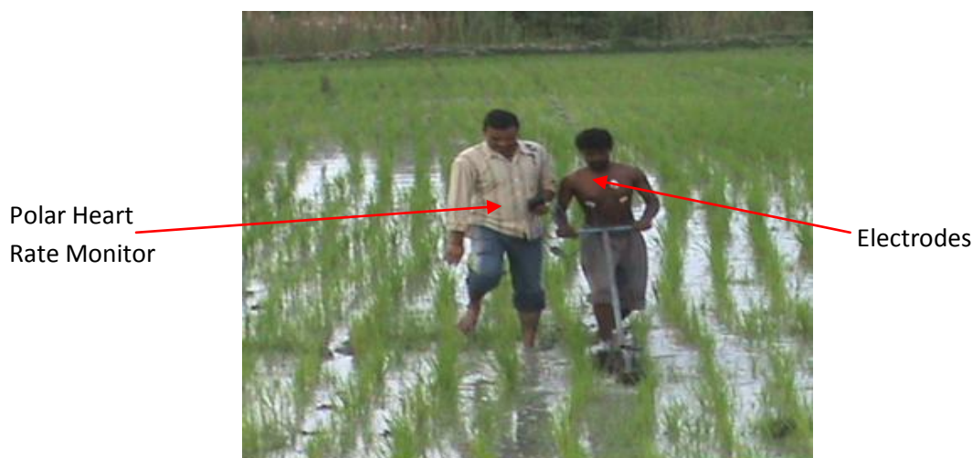
Figure 3. Measurement of heart rate during weeding operation with cono weeder.

whole body per unit time) was computed from the heart rate values of the operator and is given by the following equation (Singh et al., 2008).