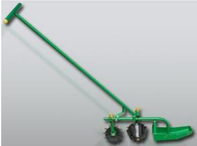
Figure 1. Schematic diagram of cono weeder.