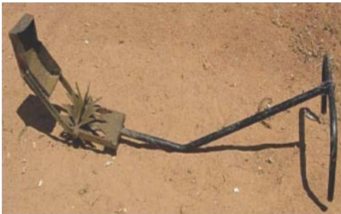
Figure 2. Schematic diagram of mandava weeder.

of work includes the heart rate (HR) and oxygen consumption rate (OCR). Furthermore, severity does not depend on EER; however based on EER severity of work load is classified. Cono-weeder and Mandava weeder are used for uprooting and burying weeds in between standing rows of rice crop in wetland condition. Ergonomical evaluation is a tool to evaluate the energy expenditures of workers, their physiological cost and suitability of the method for farm workers and how long they can work continuously without getting fatigue. Ease of performing an operation affects the output of the worker. When weeding in wetland crop (paddy), the body is in discomfort posture and while walking in puddled field the worker experiences higher oxygen consumption rate to overcome more resistance. In view of above, the ergonomic parameters (heart rate and oxygen consumption rate) of cono-weeder and Mandava weeder were evaluated in wet land condition.