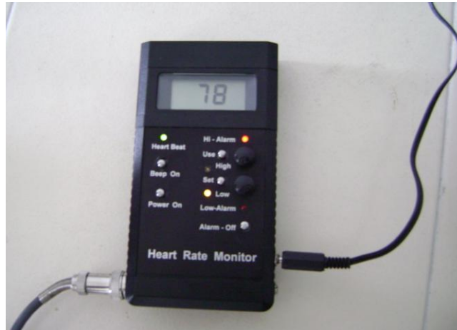
Figure 4. Polar heart rate monitor.