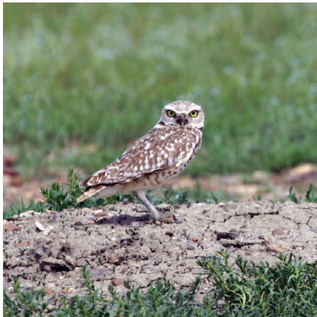
FIGURE 1. This Burrowing Owl rests atop an abandoned black-tailed prairie dog burrow on June 4, 2004, in Phillips County, Montana.

colonies (prairie dogs were absent) were monitored in subsequent years to check the status of their occupancy by prairie dogs. New prairie dog colonies were created almost yearly; we attempted to survey them for prairie dogs and owls soon after they were established. The study area and prairie dog survey methods are described in greater detail in Dinsmore and Smith (2010).