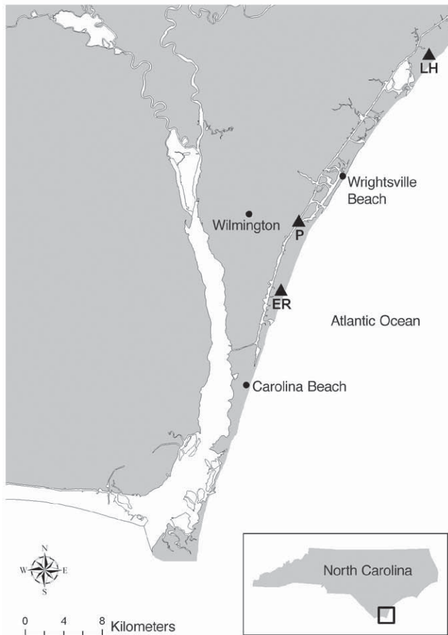
FIGURE 1. Sites of winter sampling of sparrows in coastal North Carolina: Lea-Hutaff (LH), 34° 19' 46" N, 77° 41' 31" W; Parnell (P), 34° 11' 05" N, 77° 50' 18" W; Estuarine Reserve (ER), 34° 08' 17" N, 77° 50' 49" W.

weather permitting. We divided each year of sampling into discrete blocks by month because of this relationship to the tide and to ensure that data from each of our three sites were included in each sampling block.