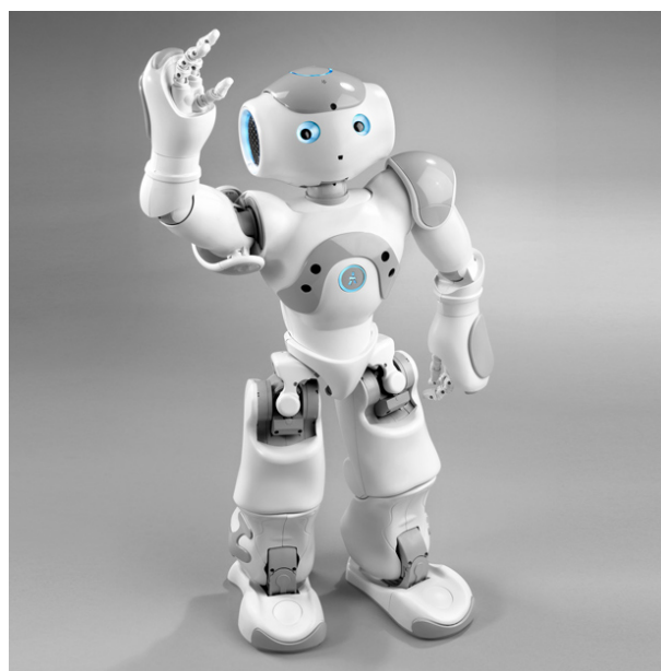
Figure 6. Nao

forward and move its legs apart. Its sensors include cameras in the head, capacitive feedback to receive 'tactile' input from contact, two gyrometers and three accelerometers for real-time data acquisition. The Choregraphe software provides text-to-speech conversion, sound localization, visual pattern and coloured-shape detection, obstacle detection and visual effects, which are output through its LEDs. NAO has 25 degrees of freedom, five in each leg and arm, one in each hand, two in the head and one in the pelvis. Both Robota and Kaspar are designed to be low cost.