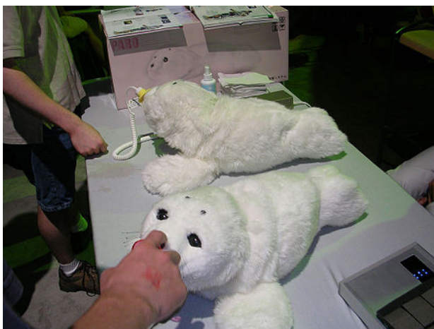
Figure 5. Paro

There have been a number of generally small-scale studies of the use of assistive social robots with elderly people [173], with most of the studies carried out in Japan with the dog robot AIBO [174] and the baby harp seal robot Paro [175, 176] (see Figure 5). Despite study limitations, many of the studies have shown positive effects from either the use of a robot or a non-functional robot or pet toy, as well as that older people are open to the use of robot technology [173]. However, it has been suggested [5] that, at least in some cases, the positive effects may be the result of an almost total lack of stimulation in their daily lives such that anything new is welcomed. In addition to AIBO and Paro, robots which have been used in studies of socially assistive robots include the cat robots, iCat [177] and NeCaRo, the humanoid robots, Bandit and Brian [178], and the machine-like robots with some humanoid features, Pearl [179, 180] and the companionable robot companion [39].