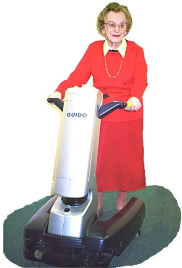
Figure 4. Guido

A number of other robotic guides have been developed but have not got beyond the prototype stage. The Smart-Robot [152] has four wheels and a chassis. It uses RFID and GPS localization indoors and outdoors, respectively. The robot continuously checks for obstacles using ultrasonic and infrared sensors and computes a new route to avoid obstacles, presenting continuous feedback to the user through the speaker and vibrating motors on the glove. Landmark information is also announced by the speaker.