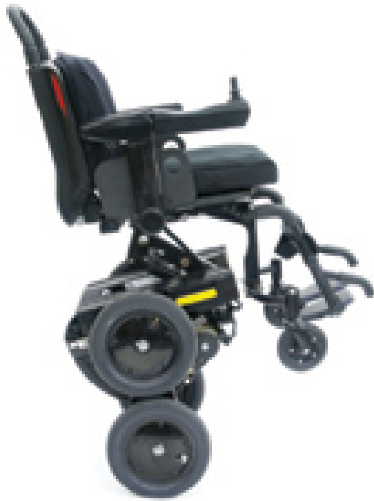
Figure 2. iBot 3000

multi-functional, including stair-climbing. It was available on prescription and required user-training. Its main functions were: (i) elevating the user to have eye-level conversations or reach shelves; (ii) stair climbing and descending, both with and without assistance; (iii) climbing curves and travelling on uneven terrain; (iv) remote control to allow the chair to be driven into a vehicle; and (v) standard power chair operation.