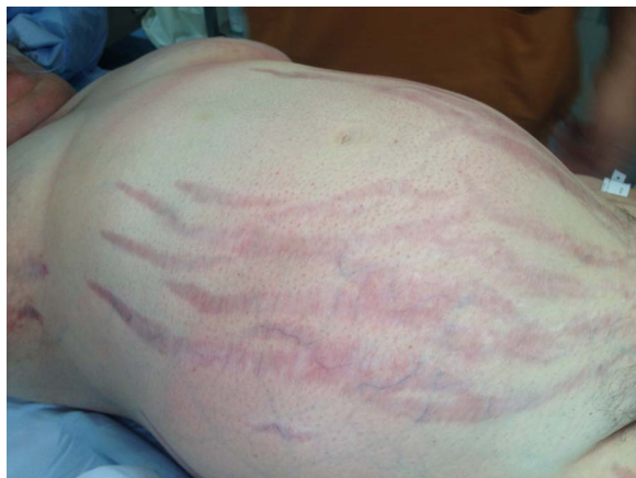
Figure 1. Patient who underwent laparoscopic adrenalectomy presenting weight gain, supraclavicular fat pads, buffalo hump and central obesity. We can observe the classical purple striae with acne.

developing the classic ‘moon face’, supraclavicular fat pads, buffalo hump and central obesity. Other frequent signs are purple striae, acne, skin thinning, easy bruising, osteopenia, proximal muscle weakness, emotional lability, menstrual dysfunction, virilization in women and infertility 2 (Figure 1). CS shortens the expectancy of life of the patients due to cardiovascular disease, diabetes as well as hypertension (caused by cortisol, excess of sodium and water retention). 1,2