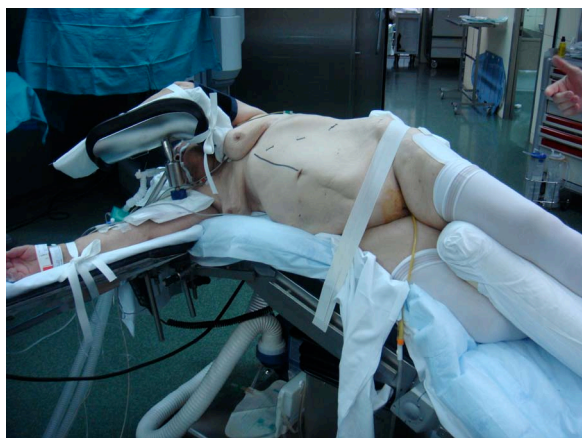
Figure 2. Patient's positioning before performing a left robotic transabdominal laparoscopic adrenalectomy in a patient with CS. CS: Cushing's syndrome.

The standard LA was first reported in 1992 by Gagner et al., 17 and nowadays, it is defined as the standard of care for adrenal pathology. 3 Even when there is suspicious of malignancy or adrenal masses >7 cm, LA is considered a safe option. 9 When compared to medical therapy, laparoscopic adrenalectomy is superior in terms of tolerance, efficacy and safety. 3 The choice of approach in laparoscopic adrenalectomy is dependent upon surgeon because there have not been found any superiority in either the transperitoneal or the retroperitoneal approach. Some surgeons do prefer the retroperitoneal approach for patients who have had prior abdominal surgery. 3 In addition, the benefits of this approach are said to be a shorter operating time, reduced blood loss and reduced risk of injury to the viscera. The retroperitoneal approach uses the retroperitoneal space in order to access the gland. A bilateral adrenalectomy can be performed in this fashion by experienced surgeons with the patient in prone position without having to move the patient. 9 Nevertheless, the lateral transperitoneal approach is preferred by most of the surgeons because the working space is wider, the anatomic landmarks are clearer and the fact that lateral decubitus and the medial rotation of the viscera allow gravity to keep the viscera away from the surgical field. The transperitoneal route is a more standardised approach where the adrenal gland is reached by entering the abdominal cavity (Figure 2).