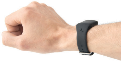
Figure 1. CueS wristband.

Table 3 shows individual participant clinical outcomes. There was no notable increase in pain or fatigue and no adverse events reported. The median increase in ARAT scores was 13 (IQR 3, 18).