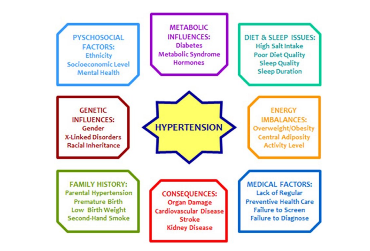
Figure 1. The many interrelated factors that influence hypertension in adolescents, and some of the serious consequences that result from delayed diagnosis and treatment.

between 2% and 5%, and the prevalence of prehypertension is estimated at between 4% and 15%, 5,6 but studies in both the United States and Europe have found that only 13% to 26% of childhood hypertension is properly diagnosed. 1,2,7-9 Children with primary hypertension may be asymptomatic or the symptoms may be mild and seemingly unrelated, such as changes in behavior or school performance, nosebleeds, headaches, or shortness of breath. 10