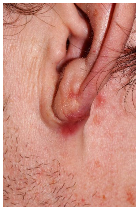
Figure 8. Day 30 showing a fully healed small scar.

The authors would now consider intralesional cryotherapy as a useful tool in their armamentarium for prominent resistant or recurrent keloid. Future experience with other refractory keloids will guide its clinical applications further.