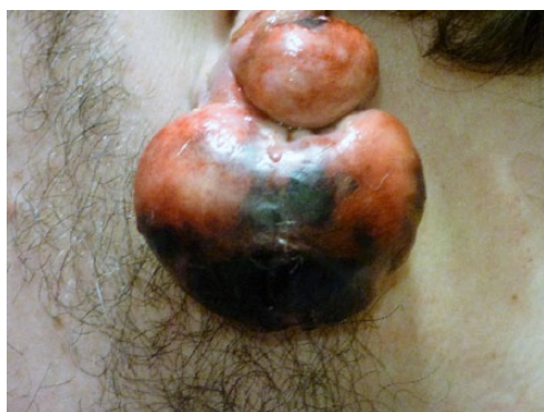
Figure 5. Day 8 post treatment showing necrotic tissue.