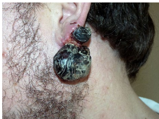
Figure 6. Day 18 showing dry necrosis of keloid scar.

self-examination between these appointments and contact the unit if he has any concerns. He found the regular injections prior to the cryotherapy difficult to tolerate and the one-off cryotherapy treatment much more manageable. To date, the patient is very pleased with the treatment process. He has not had any adverse effects such as persistent pain. He is keen to share his images in order to help patients with similar troublesome keloid scarring. The procedure has since been performed on eight patients in this department.