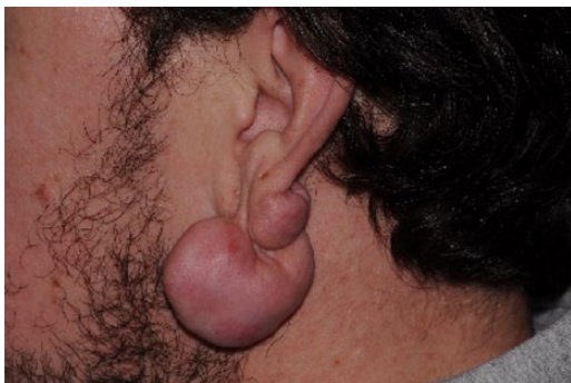
Figure 2. Keloid 15 years later after three operations, 24 injections of steroid or steroid and 5FU in combination, pressure clips and laser therapy.