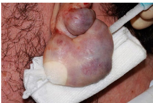
Figure 3. Needle inserted through the keloid and freezing with liquid nitrogen commenced.

After counselling the patient regarding intralésional cryotherapy and potential complications, including infection, bleeding, persistent pain, failure of the treatment and recurrence of the keloid scarring, he consented to the treatment.