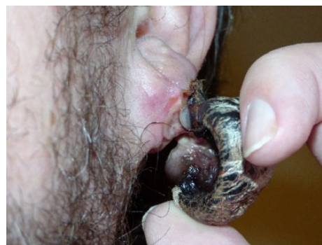
Figure 7. Day 21 showing the patient demonstrating that the necrotic keloid is separating.

self-examination between these appointments and contact the unit if he has any concerns. He found the regular injections prior to the cryotherapy difficult to tolerate and the one-off cryotherapy treatment much more manageable. To date, the patient is very pleased with the treatment process. He has not had any adverse effects such as persistent pain. He is keen to share his images in order to help patients with similar troublesome keloid scarring. The procedure has since been performed on eight patients in this department.