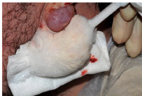
Figure 4. Lower portion of the keloid frozen with the ice ball appearance.