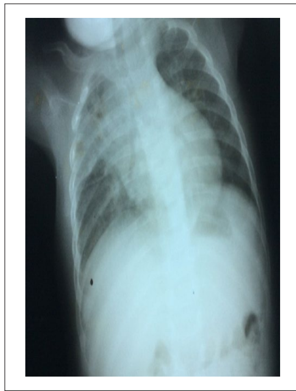
Figure 3. Tuberculosis-excavated pneumonia of the right upper and middle lobes on the 20th day of tuberculosis treatment (Case No. 7).

TP is a rare clinical form of pulmonary tuberculosis. Its incidence varies from one series to another. Steponaviciene and Kudzyte, 5 in Lithuania, reported a series of 69 cases in 10 years, and Goussard et al, 2 in a South African cohort, reported 24 cases. Other authors have rather described TP within a cohort with pneumonia from all causes, for example, Oliwa et al, 6 in a series of 3644 children admitted with acute pneumonia and smear, reported a TP prevalence of 7.5%. In contrast, in countries where the incidence of HIV infection is very high, the prevalence was higher, in the range of 12% to 18.9%. 7,8 TP occurs at any age but with a predominance in children under 5 years or under 2 years. Thus, in our series, 6 children were under 5 years of age, including 4 under 2 years of age. These results are similar to those of Goussard et al 2 and Steponaviciene and Kudzyte, 5 who